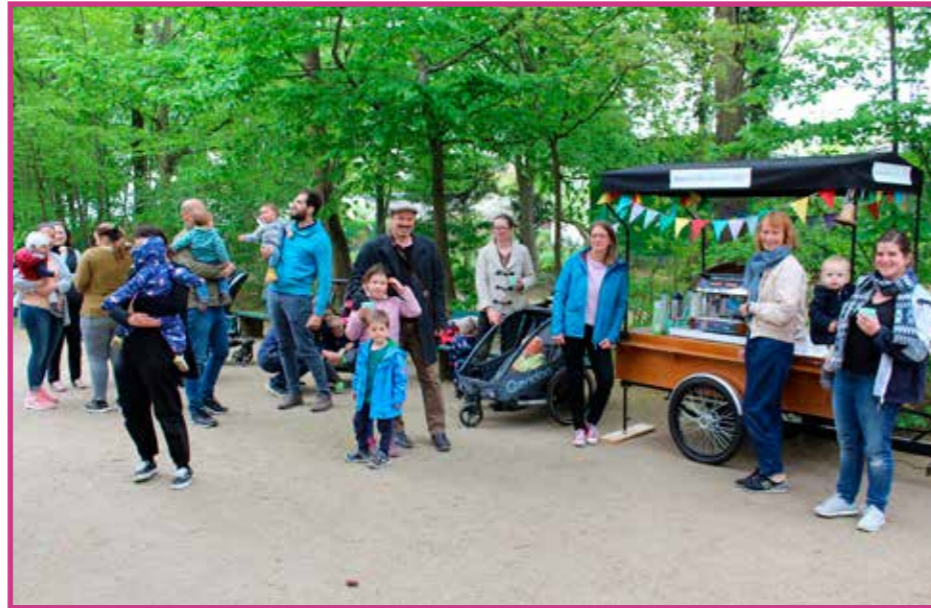
Coffee-Bike on Tour

The coffee bike is there for everyone. Everyone's invited for a cup of coffee: at the parents' café, after services or at congregational gatherings. And in addition, the bike goes out to the people. The coffee bike will continue to be out and about in the coming months, stopping at playgrounds in Lerchenberg to reach people with very different beliefs and ways of life. 'It's important to us as a congregation to go beyond the church, to be active in a social context and open to everyone,' says Reverend